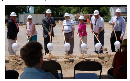
Library Board Members breaking ground on new building for Greenup Library.

Big things are happening at the construction site for the new main library for Greenup County. Watch this spot for pictures and updates.