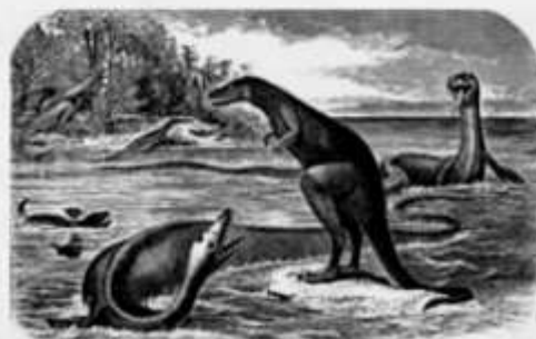
Dryptosaurus (center) confronting Elasmosaurus , with two Hadrosaurus in the background. By Edward Drinker Cope, 1869

I think that's how a lot of people begin their descent into the world of dinosaurs. For patrons of Duncan Public Library in 1921, they may have first learned about dinosaurs through artists like Edward Drinker Cope's 1869 illustration of Dryptosaurus (center) which depicts the reptiles