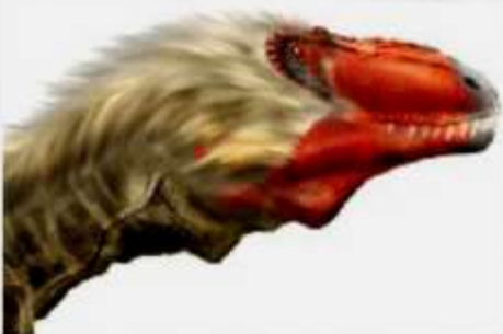
Josep Asensi - modern speculative art

Fast forward to 2021. Now Dryptosaurus has been fleshed out and given feathers!