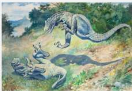
Leaping Laelaps by Charles R. Knight, 1897

Edward Drinker Cope may have been one of the first to describe the Dryptosaurus (or Laelap as it was popularly known), but Charles R. Knight brought it deep into the public imagination with his painting at the Chicago Field Museum.