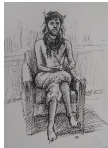
Mr. Tumnus / The Lion, the Witch, and the Wardrobe.

Character Sketches : "Character Sketches" began in April 2018. Models representing literary characters are costumed and pose while participants sketch them. This is not a mentored program. It is simply a participation event. This program has been very successful to date. Program rules are (1) there must be an equal number of male and female characters resented throughout the year, (2) no two characters can be from the same literary work in the same year, and (3) no character can be repeated within two years. "Character Sketches" was expanded in FY 2019 to begin in January (rather than April like the previous year).